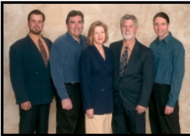
Our staff and associates will provide you with the highest quality video services available

"As a videographer, I become involved with the people I video tape and their experiences of the moment. The Storybook Videos™ I create, and the moments I capture, reflect the emotions I feel and show the many forms of love in life. If you'd like to discuss a video session or your wedding plans, give me a call. I'll be happy to talk about schedules and pricing, and to answer any further questions you may have."